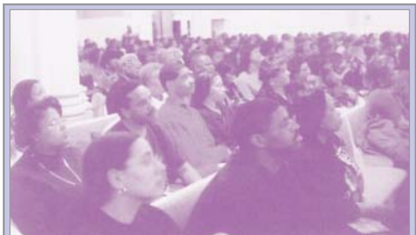
The pews are filled during a typical Sunday worship service at Salem Baptist Church of Chicago