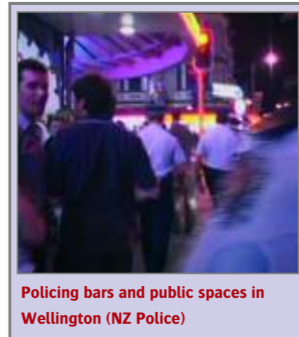
Policing bars and public spaces in Wellington (NZ Police)

In 2002, it was contracted to undertake a national review of Last Drink Surveys. This led to the current commitment by NZ Police to a nationally consistent operational practice with a fully analysable national database.